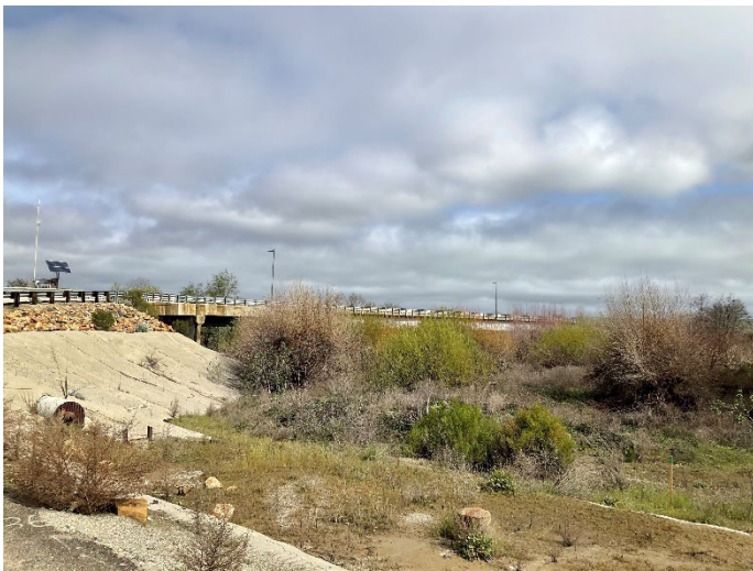
Bridge to Production Field