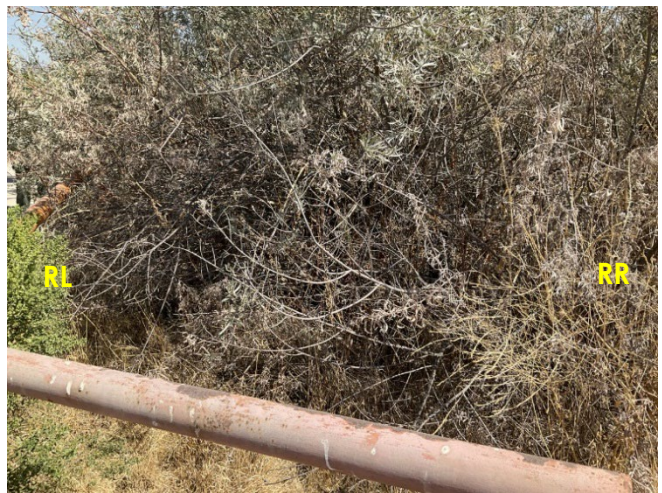
Across Left Bank