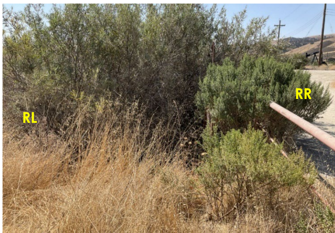
Across Right Bank