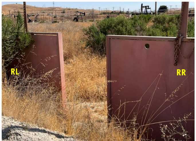
Across Left Bank