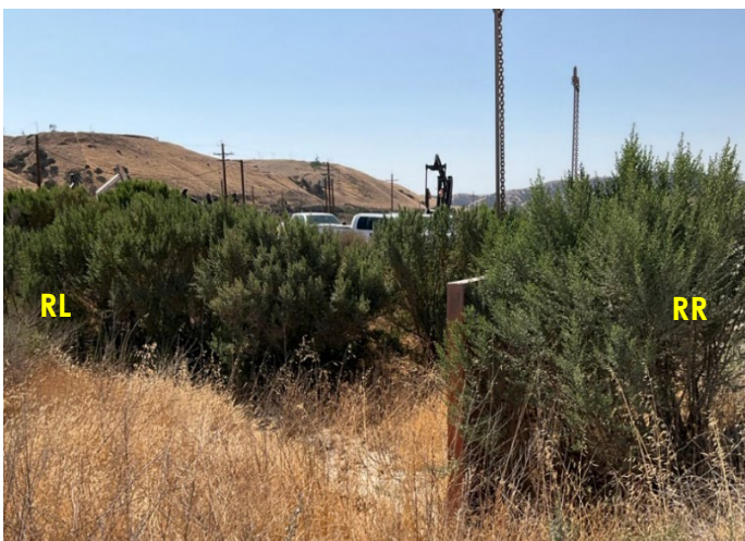
Across Right Bank