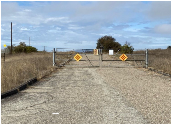
Locked Gate that can Access RL